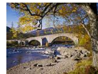
Brig o' Dee